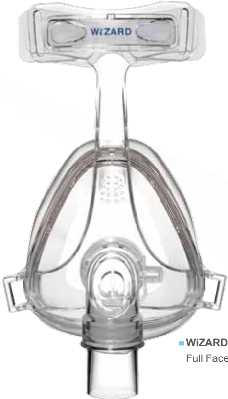
■ WiZARD 220 Full Face Mask