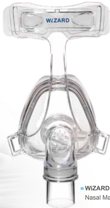
■ WiZARD 210 Nasal Mask